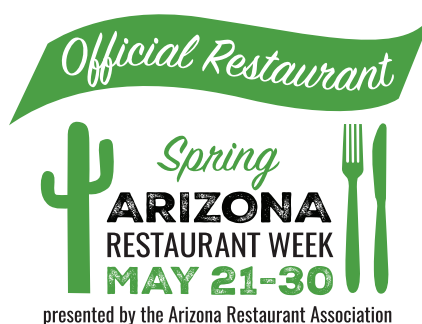
Official Restaurant Widget